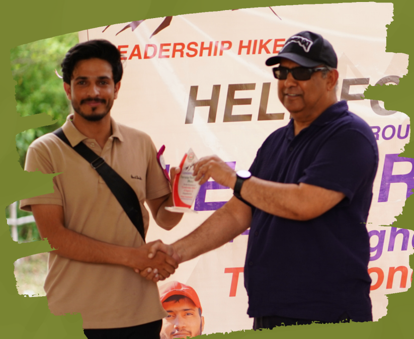
Emerging Youth Leader