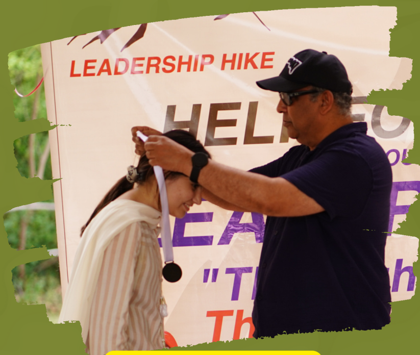
Best Story Teller