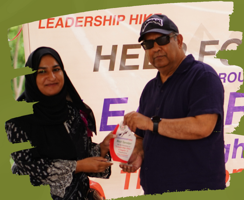
Speaker of the Event